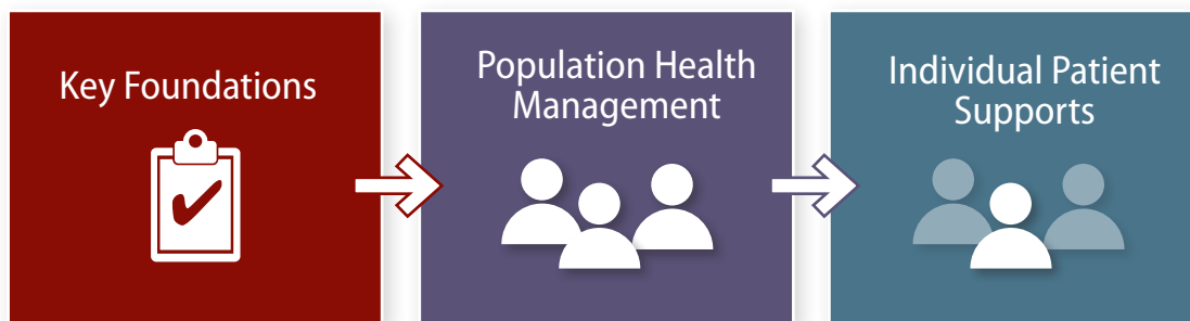
Figure 1. Hypertension Control Change Package Focus Areas

While the science behind cardiovascular risk reduction is continually evolving, there is strong evidence that a systematic approach to HTN management can significantly improve HTN-related care processes and outcomes. The purpose of the HCCP is to help healthcare practices put systems in place to care for patients with HTN more efficiently and effectively. The HCCP is broken down into three main focus areas (Figure 1):